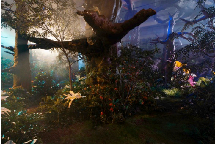
Paul McCarthy's "WS" at the Park Avenue Armory

So you're still in New York and reading the blogs. Here are ten fun shows made for summer, from McCarthy's twisted forest, to MonkeyTown, to a survey of New York's untapped Jews.