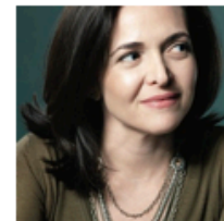
Anna Holmes: Misreading Sheryl Sandberg.