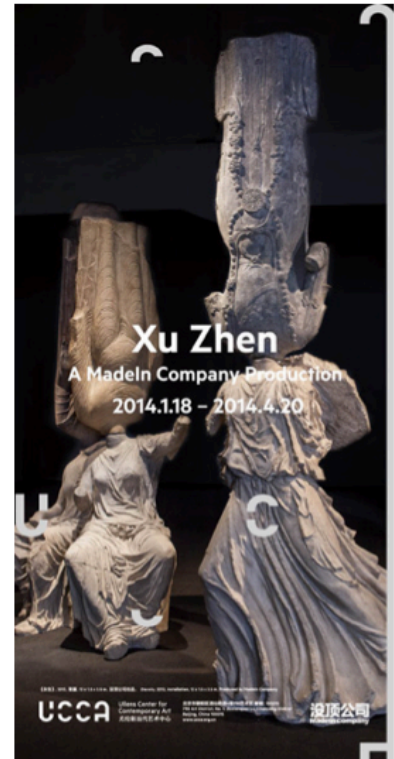
Advertise on Hyperallergic with Nectar Ads

You may think there's nothing going on this week, but you'd be wrong. It's not Christmas yet! Try artist-inspired cocktails, 3D projections, your last chance for two great shows, and an apocalyptic vision of London circa 2027.