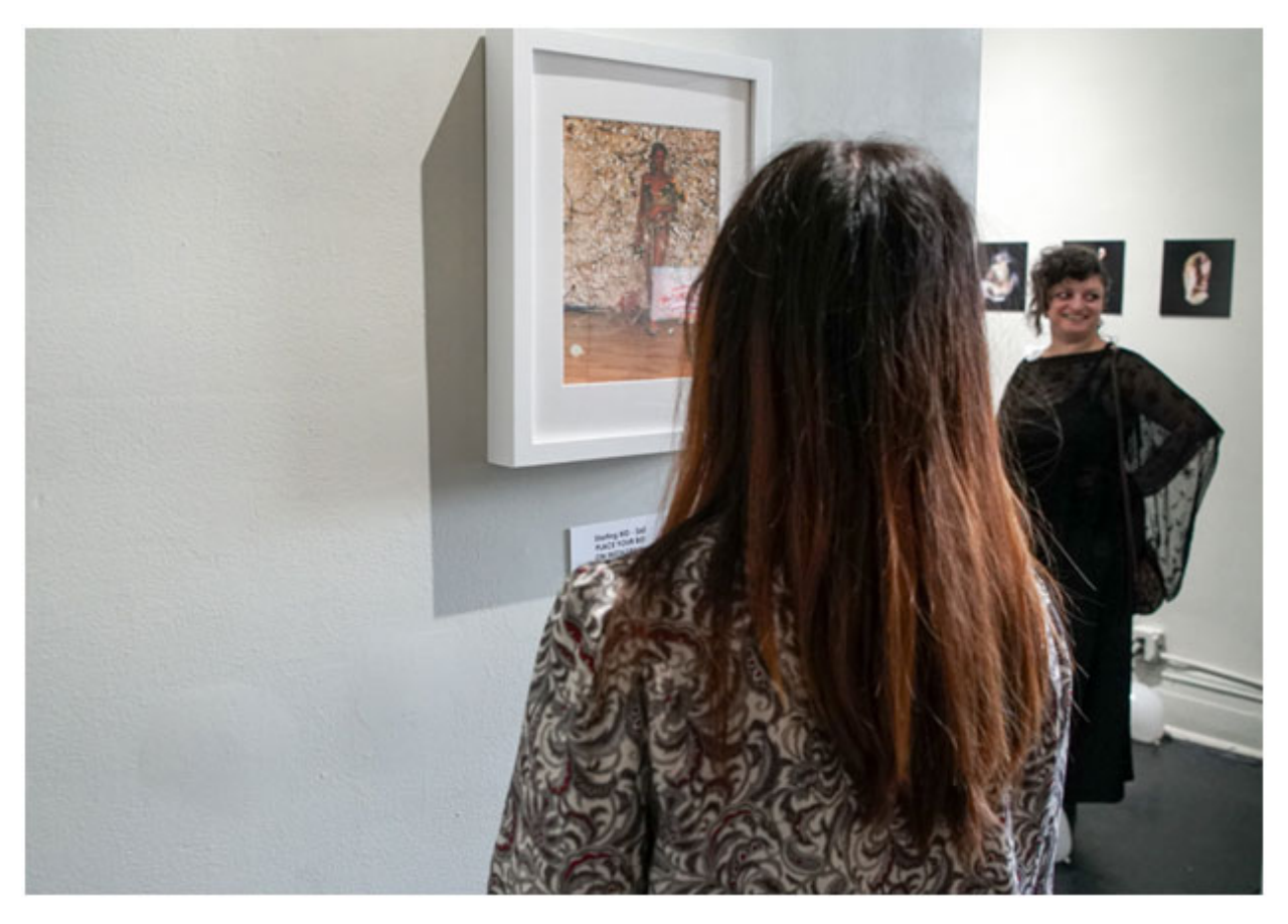
TIAB Soft Launch Fundraiser, Radiator Gallery

KH: You've had a number of soft launch events at various NYC galleries this year? What's next in 2019?