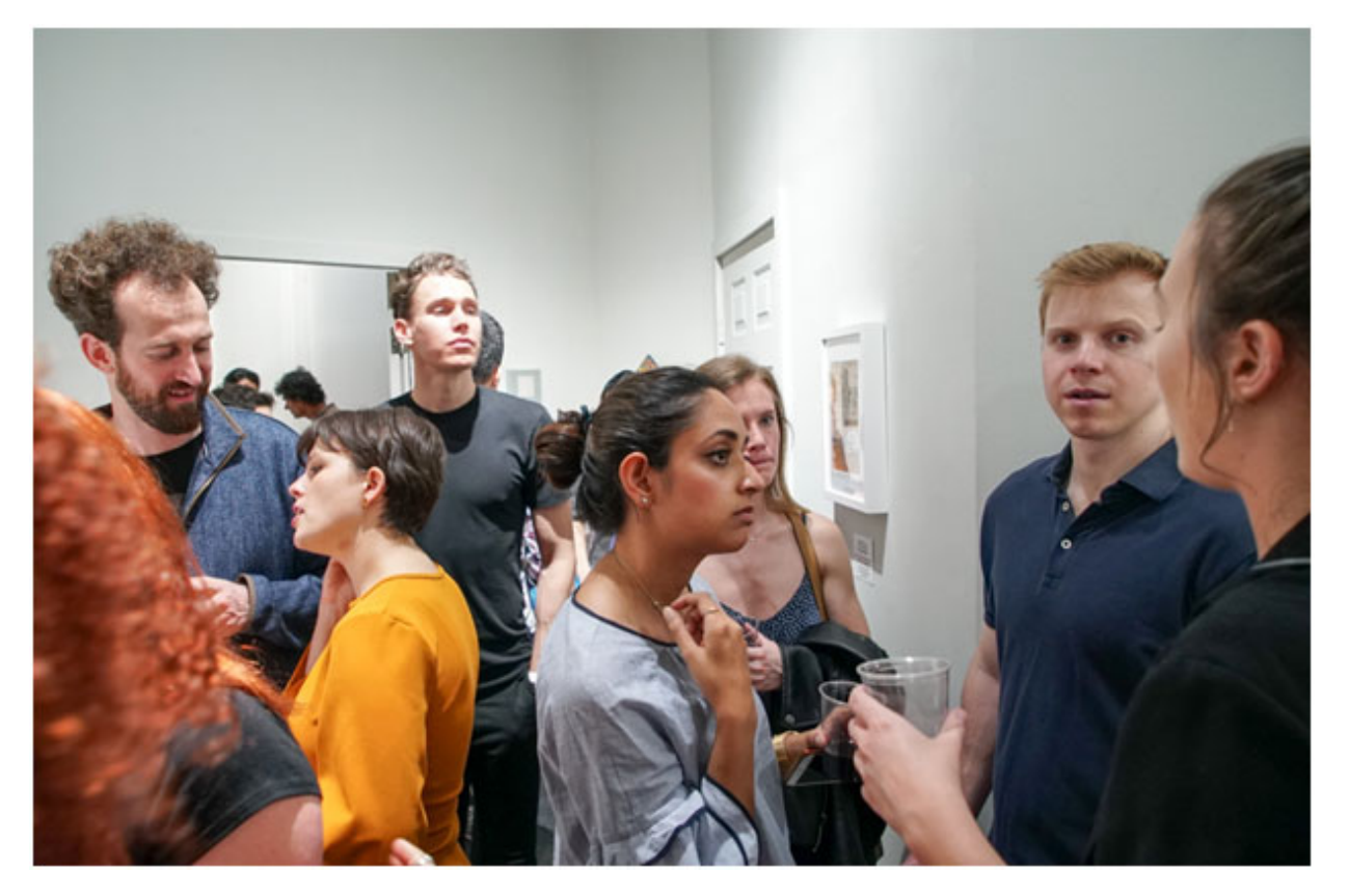
TIAB Soft Launch Fundraiser, Radiator Gallery

TIAB will officially launch this upcoming Spring, with a number of concurrent programs which will continue on into the Summer and potentially even the Fall. My idea is to actively engage the city and create an ongoing conversation between artists, organizations, and the public.