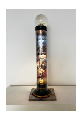
DARIO MOHR Ohene 2023

Snow globe, acrylic tile, photography collage printed on window film adhered to plastic cylinder, LED light, acrylic on leather rope 25 \times 8 \times 8 inches