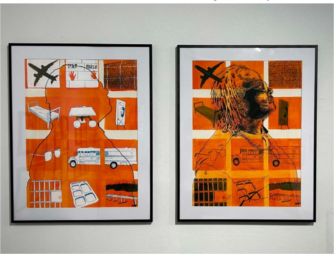
Installation view of Medar De La Cruz's "Remembering Rikers" (2023), inc and acrylic on paper, 28 1/2 x 22 1/2 inches each framed