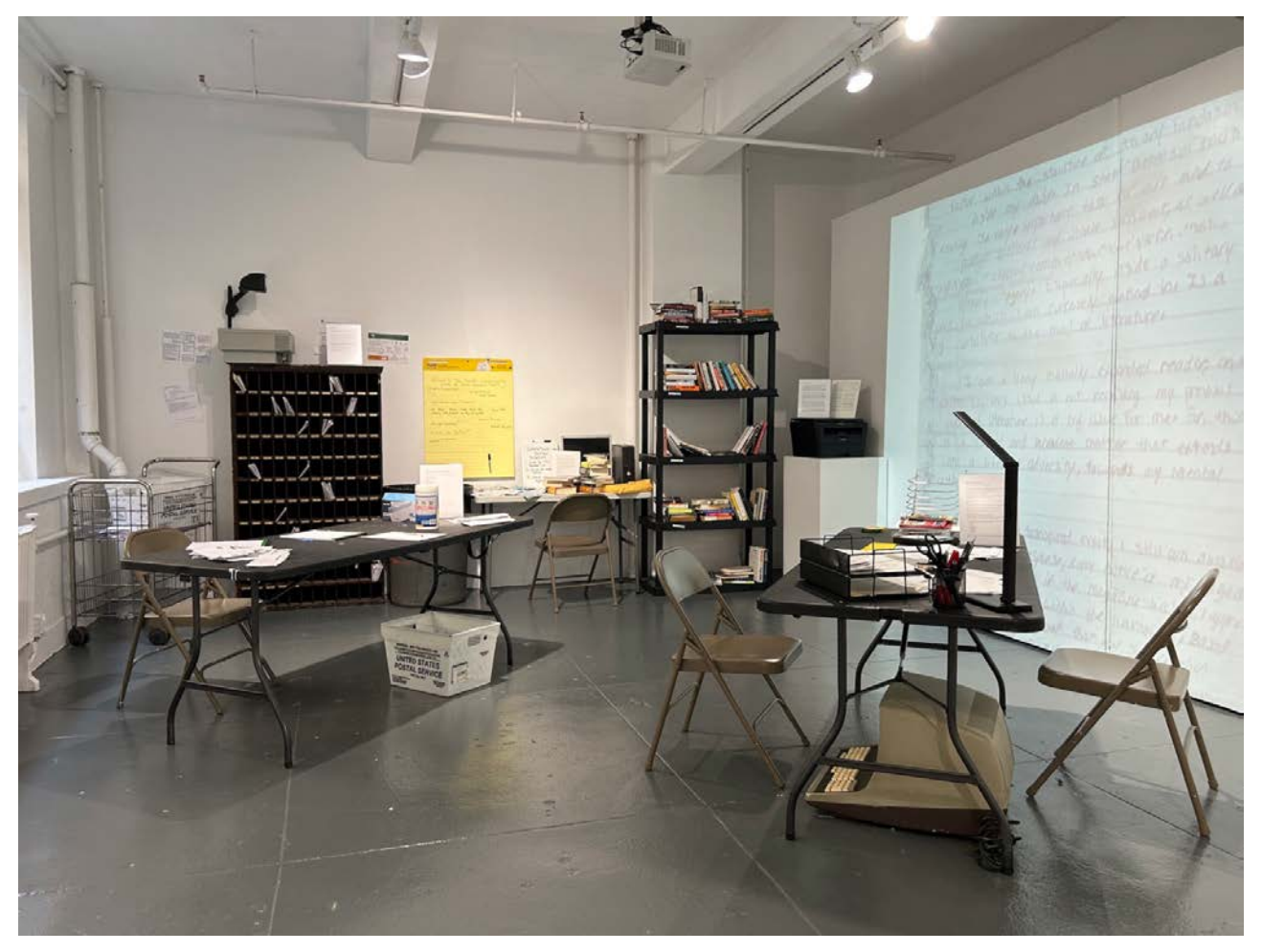
The exhibition included this model prison mailroom installation, which displays how mail is censored by prison staff.

also impacts writers in prison, as drafting any sort of publication is often "time consuming and cumbersome" due to policies that require physical mail to be scanned and digitized .