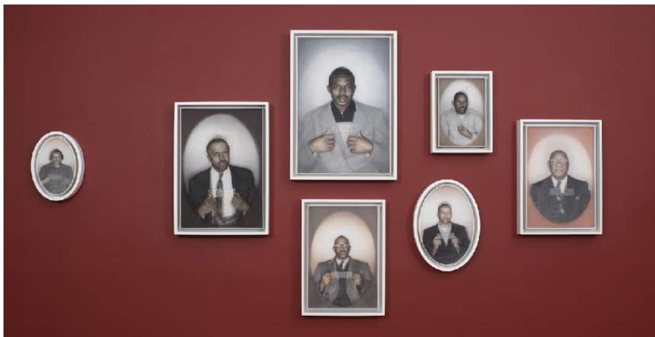
McCallum & Tarry, Studies for The Evidence of Things Not Seen , 2008, Installation view, oil on linen and toner on silk