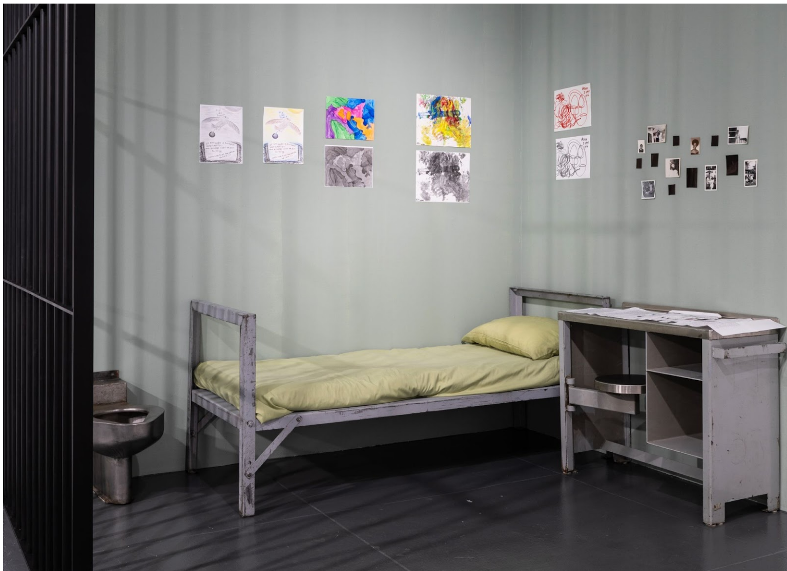
“Censorship in Quarto,” 2023. Prison cell installation 6 x 9 feet, Mariame Kaba

Visitors can also step into a mock prison mailroom, where they are encouraged to sift through a heap of administrative documents. For incarcerated people, most incoming communications are subject to prison officials’ examination . The papers in the installation read: “Notice of Non-Delivery,” “Denial of Property Pre-Approvals,” “Notice of Changes to Correspondence Rules.” This is the sterile, bureaucratic language used to deny incarcerated people’s access to educational materials and correspondence with their loved ones. On one table, what appears to be a pile of mail turns out to be dozens of split envelopes—all that remains of confiscated letters.