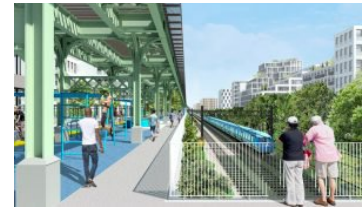
New renderings of proposed Triboro Corridor, 17-stop outer borough light rail and linear park