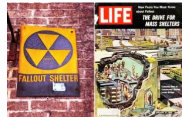
Fallout Shelters: Why some New Yorkers never planned to evacuate after a nuclear disaster