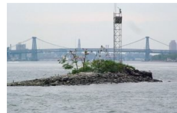
U Thant Island: Manhattan's smallest island that's off limits to the public