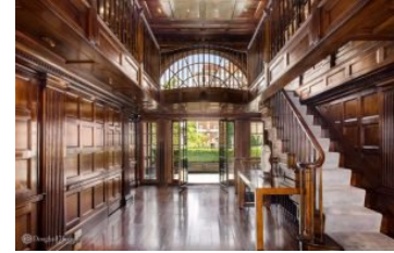
Elizabeth Arden's former Sutton Place townhouse hits the market for $16M