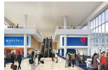
Construction officially underway at Delta's new $4B LaGuardia facilities, new renderings and details